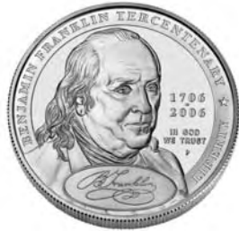
"The Founding Father"

In a conference report to Public Law 104-52 that created the United States Mint Public Enterprise Fund (PEF), Congress directed the United States Mint to report quarterly on implementation of the PEF. This report is designed to fulfill that requirement.